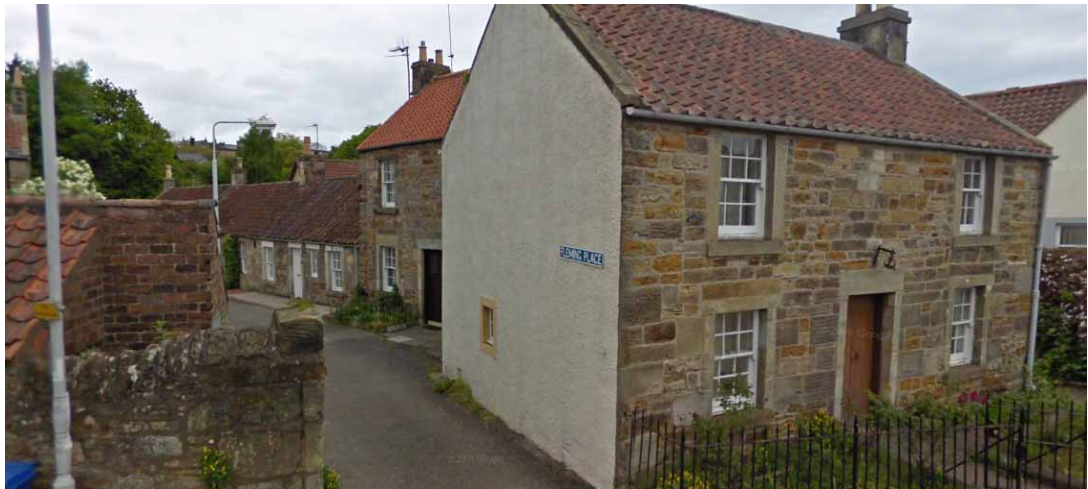
entrance to Fleming Place, St Andrews [Google Streetview]

1858-1861: Published St Andrew's Magazine (monthly) - a sample issue has been reproduced in facsimile at http://www.genealogy.ianskipworth.com/pdf/standrewsmag.pdf 1861: Residence Fleming Place, St Andrews - with wife, 3 children and 1 servant