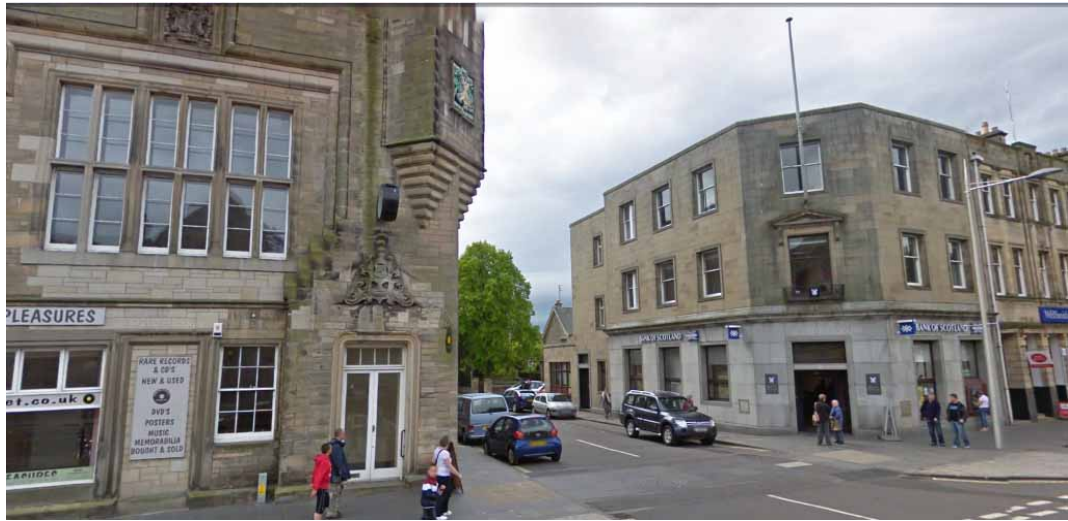
cnr South St & Queens Gardens, St Andrews

1858-1861: Published St Andrew's Magazine (monthly) - a sample issue has been reproduced in facsimile at http://www.genealogy.ianskipworth.com/pdf/standrewsmag.pdf 1861: Residence Fleming Place, St Andrews - with wife, 3 children and 1 servant