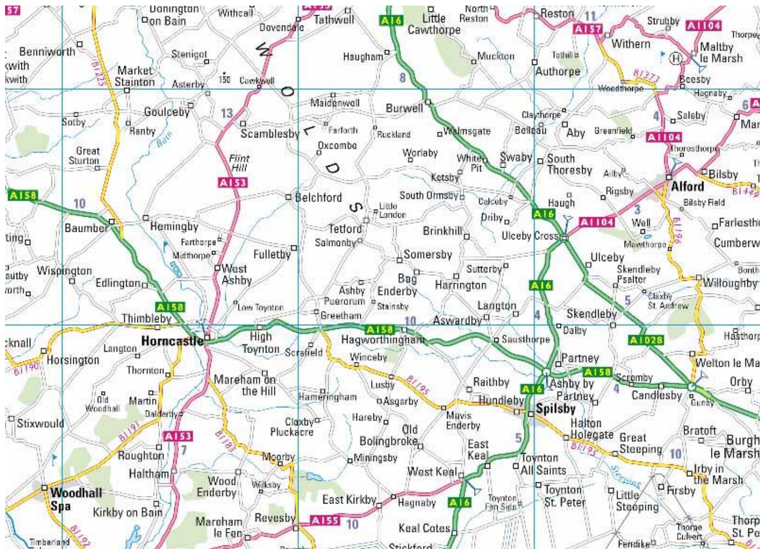
Scale: one map square = 10 km