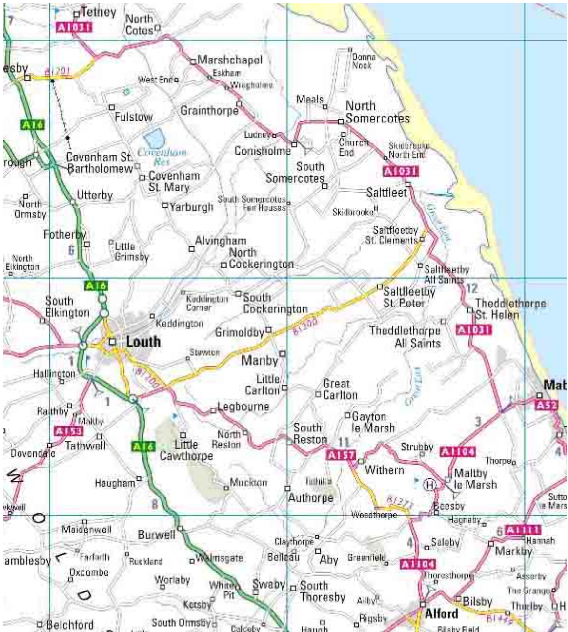
Map of the Lincolnshire Marsh

South Ormsby, principal residence of the main Skipwith family, is almost off the map to the south; North Cotes, subject of the faming study in Appendix 3, is almost off the map to the north; Manby, east of Louth, is rather more important than surrounding villages today because an airforce base and housing were built there in World War II. These facilities are now used for an off-road recreational driving centre.