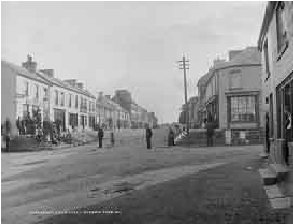
Greencastle Street, Kilkeel, County Down taken about 1808