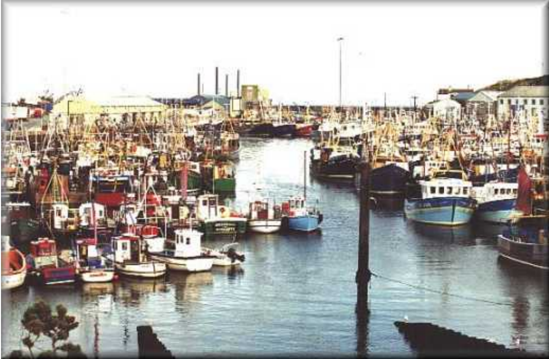
View of Kilkeel Harbour