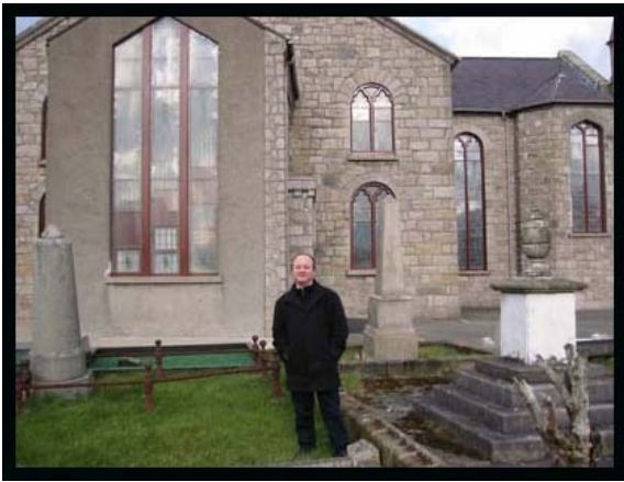
Mourne Presbyterian Church, Kilkeel [modernised 1933]