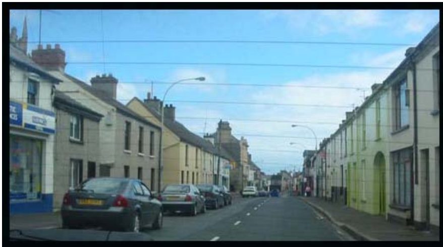
{below} Newry Street, Kilkeel about 2000